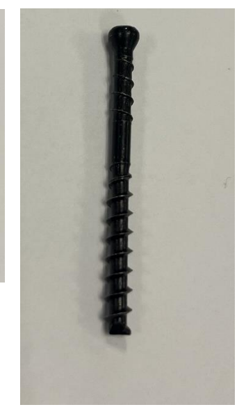
Figure 4. CAMO Edge Screw Hidden Fastening System.