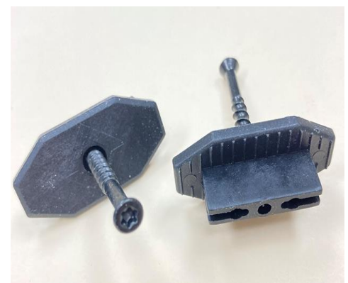
Figure 2. Aegis Clip Hidden Fastening System.