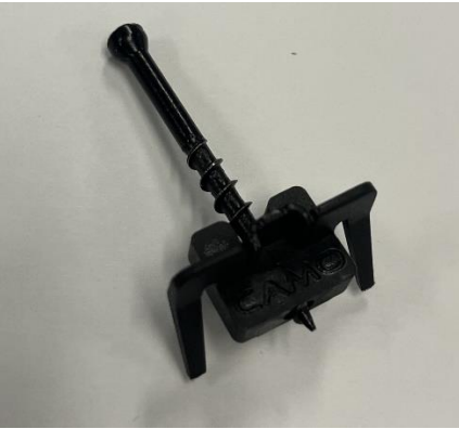
Figure 3. CAMO WedgeClip Hidden Fastening System.